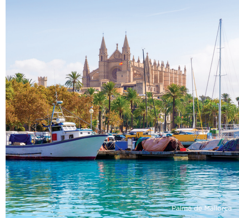
Palma de Mallorca