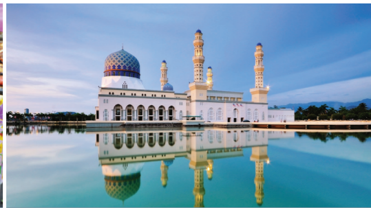
Visit the iconic 'Floating Mosque'