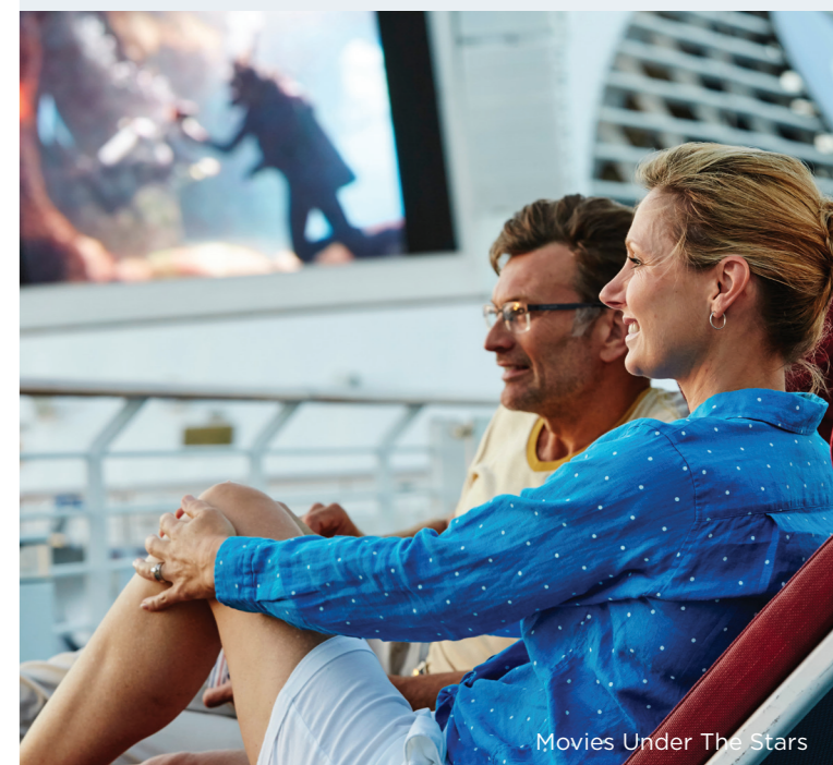
Movies Under The Stars