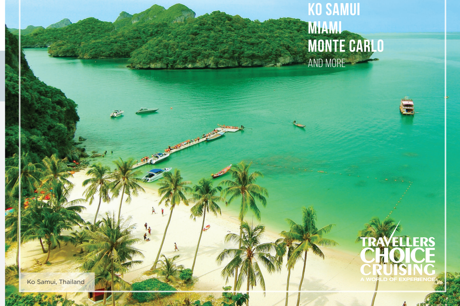
Ko Samui, Thailand

DARWIN FLORENCE GOA KO SAMUI MIAMI MONTE CARLO AND MORE