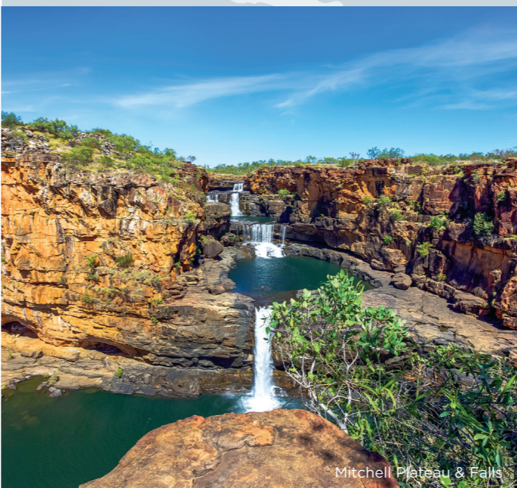
Mitchell Plateau & Falls