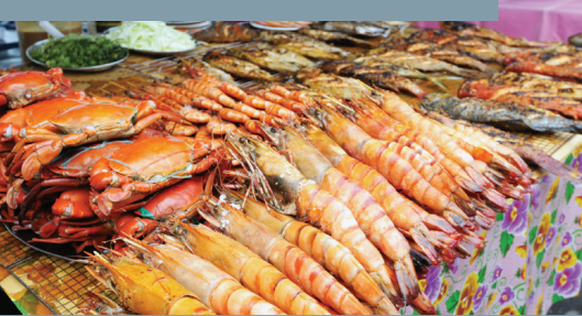
Try local delicacies at the night market