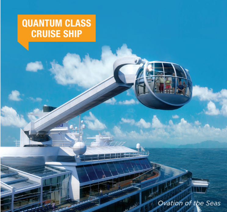
Ovation of the Seas