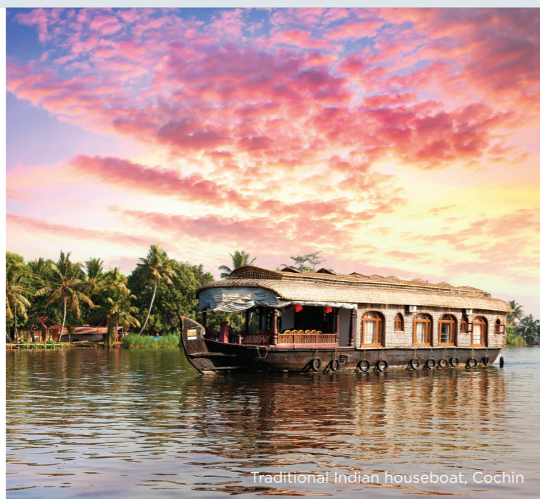
Traditional Indian houseboat, Cochin