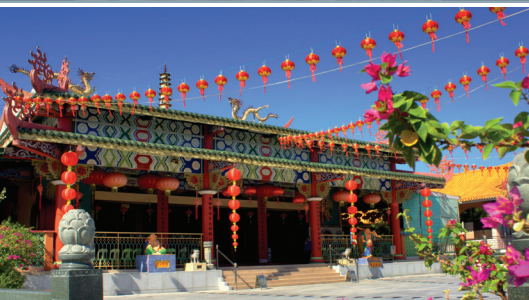
Explore the Puh Toh Tze Buddhist Temple